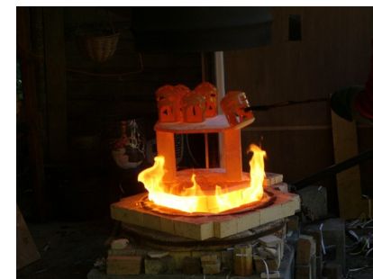
Raku pieces being removed from the firing kiln with tongs.

To book a date for your group, contact us by calling: