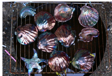
Finished Raku Pieces from a student workshop.

Guild General Meetings are the second Wednesday of each month, except July and August and are held at the Station at 7pm, except when there is a scheduled social or instructional event.